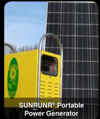
SUNRUNR® Portable Power Generator