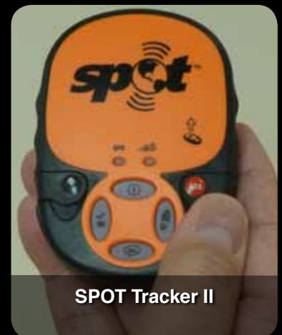
SPOT Tracker II